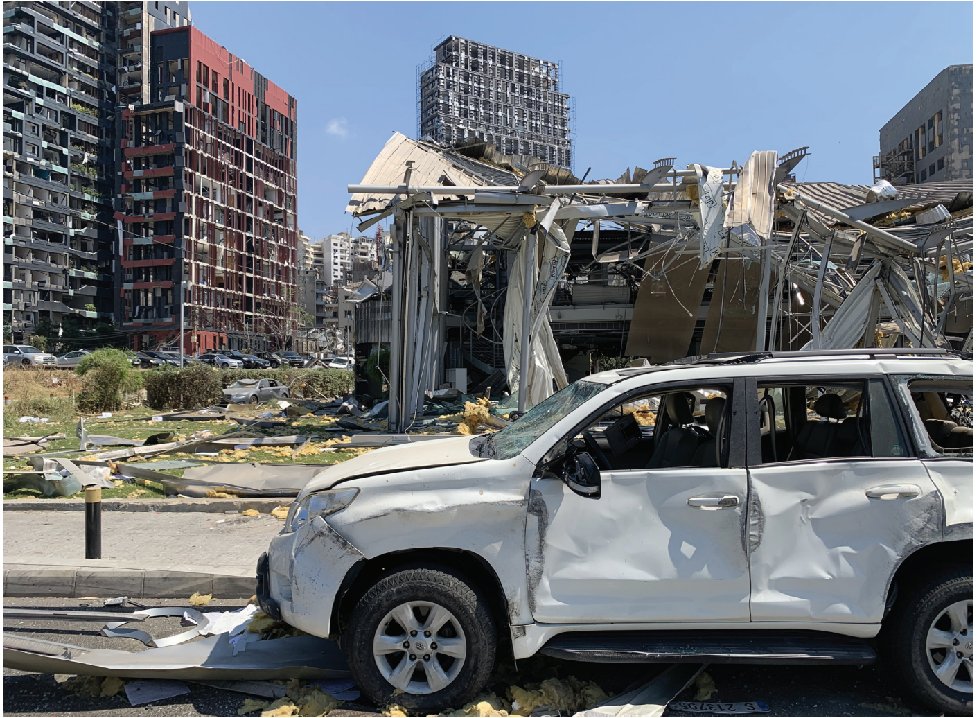
Above: A car stranded in front of what used to be the Audi showroom. In the left you can make out the damaged remains of both LIV and Skyline.

I have a great number of friends and colleagues who established contact right after the explosion but those people were reaching out on a personal level. I don't think that the "international architectural community" is very much concerned about this specific tragic event. The few signs I see are very much superficial as the architectural world is, in general, very disconnected from politics and these kinds of realities that, in my opinion, are too complex for architects to grasp or discuss in any meaningful way.